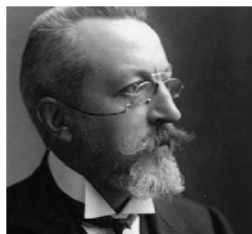
Figure 4, Henri Pirenne (1862-1935).